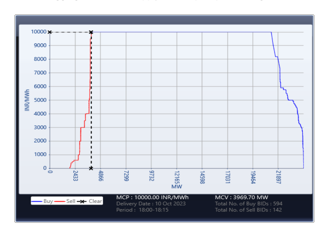
Chart-4: Aggregate Demand-Supply Curves (DAM) in Shortage scenario