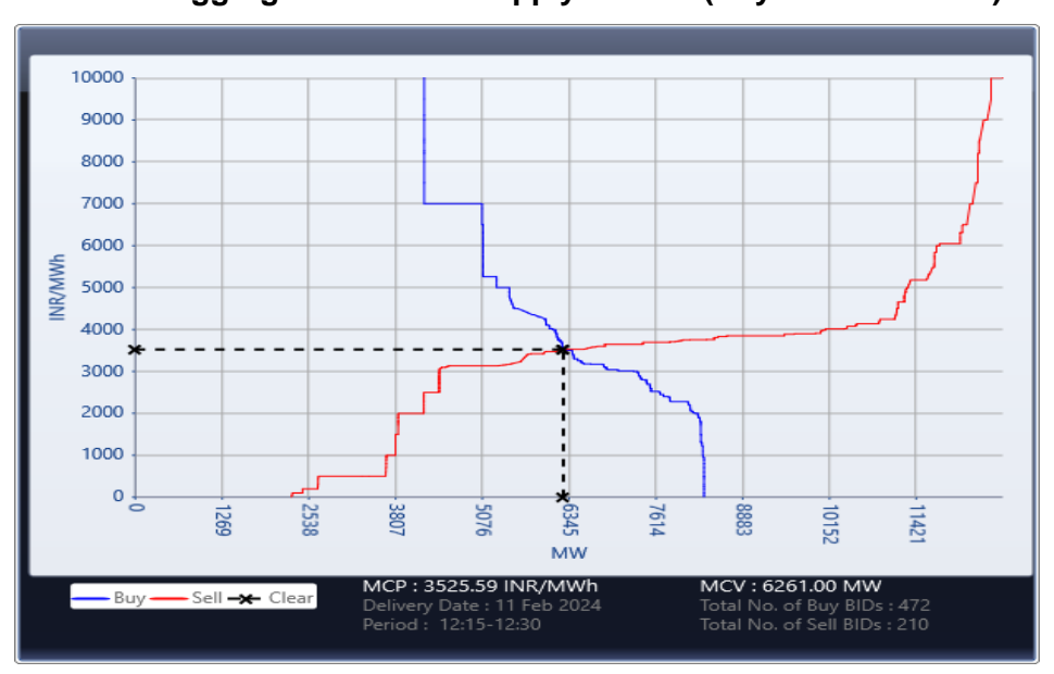
Chart-2: Aggregate Demand-Supply Curves (Day-Ahead Market)

constraints, if any, the final MCP and MCV are determined. The price discovered for an unconstrained market is uniform for all the buyers and sellers who get cleared. A typical AD-AS curve intersection is depicted in Chart-2.